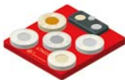
47A010 Conductivity Sample Holder

3 (Part No 47A025) and 5 (Part No 47A010) Sample Holders are available to house the Conductivity Reference Blocks and Dual Reference Sample.