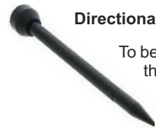
Directional Tube (included in standard kit)

The air probe is the most basic method of detecting ultrasound. It can be directly connected to the testing device, or via the flexible cable.