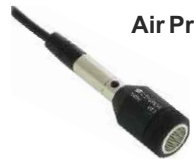
Air Probe C50 (included in standard kit)

The air probe is the most basic method of detecting ultrasound. It can be directly connected to the testing device, or via the flexible cable.