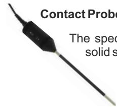
Contact Probe C52

To be fitted onto the air probe C50 to improve the focus of the probe.