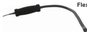
Flexible Air Probe C53