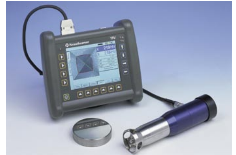
The TIV hardness tester with probe and hardness reference block. The probe contains high-tech features – the optical system and the CCD camera enable viewing through the diamond. Direction independence is also a proof of the patented Krautkramer technology: you can measure in any direction – without any additional settings.

The color LCD of the TIV hardness tester does not only show you the image of the diamond's indentation but also the directly displayed reading in the selected hardness scale. The graphic user interface shown on the display is adapted to the known Windows standard. In this way, you will swiftly have a good grasp of how the instrument should be operated, irrespective of if you want to configure, measure, evaluate, or store. The special extra: You do not need a mouse to select functions because the instrument has a touch screen capability using a pen. However, as an alternative, conventional pushbuttons are also available for most of the functions.